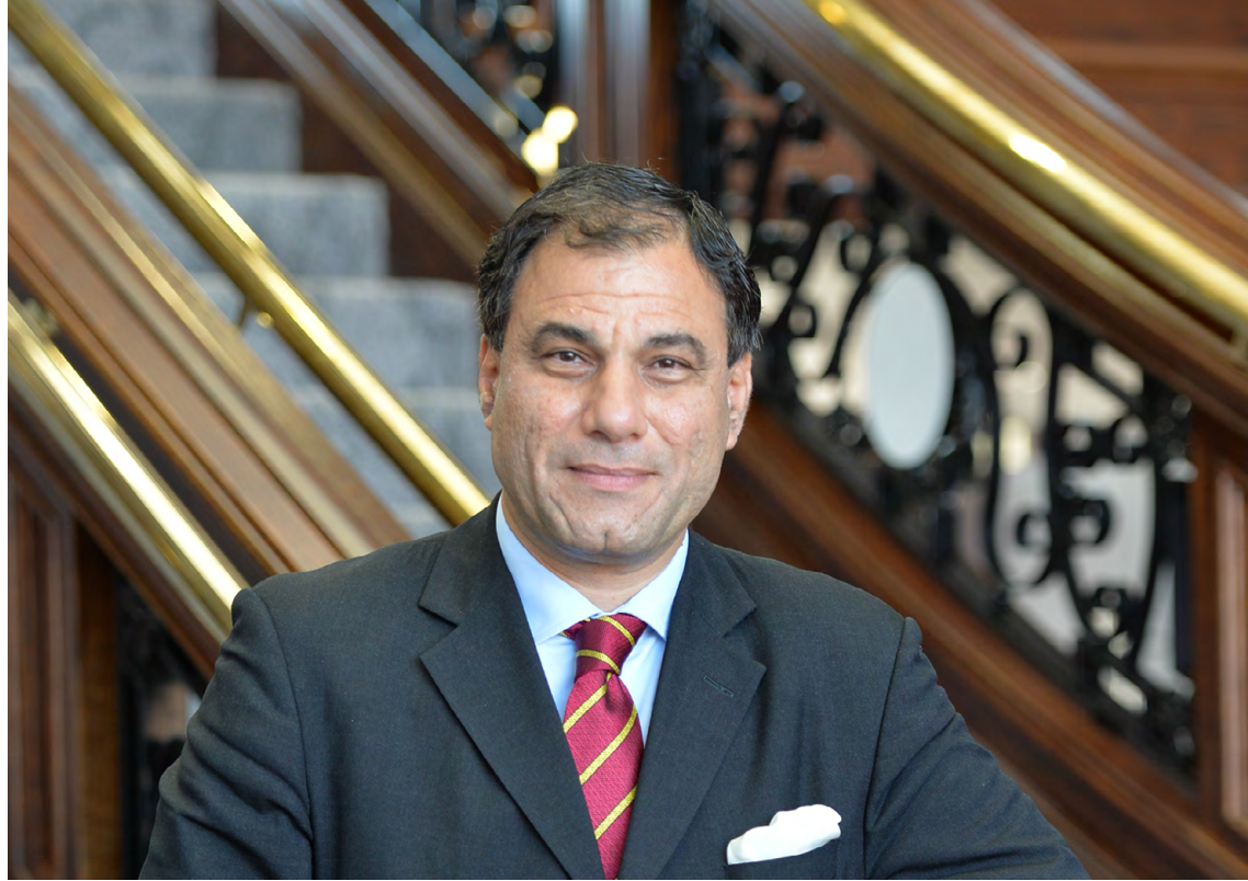
Lord Karan Bilimoria.

Supporting that ecosystem was never just about building a business. It was about standing with South Asian entrepreneurs who