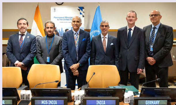
Minister of State for External Affairs of India, Kirti Vardhan Singh, with Ambassador Harish Parvathaneni and guests on May 7, 2026, at the United Nations, in New York.

Ambassador Harish also highlighted the use of India's digital public infrastructure to develop large-scale practical