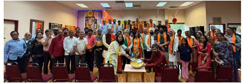
OFBJP-USA members and guests pose for a group picture with Jhal Muri, a popular street snack in Bengal, on May 10, 2026, at the India International School in Chantilly, Virginia.

Muppalla said the election results reflected growing public dissatisfaction with what he described as the TMC government's tyranny, alleging