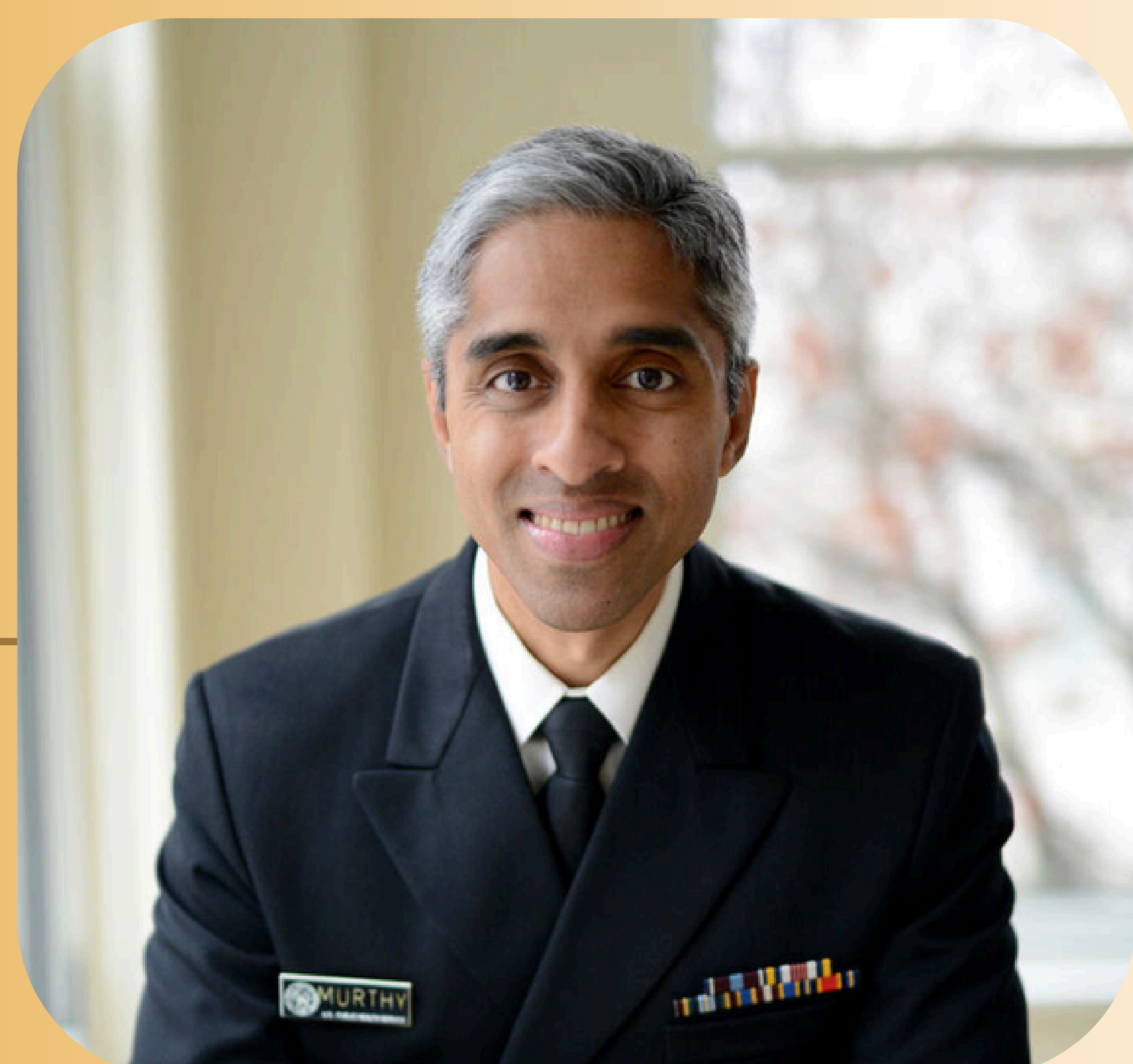
Dr. Vivek Murthy 19th and 21st Surgeon General of the United States